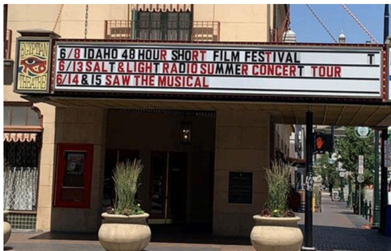
Salt & Light Radio on the marquee in downtown Boise