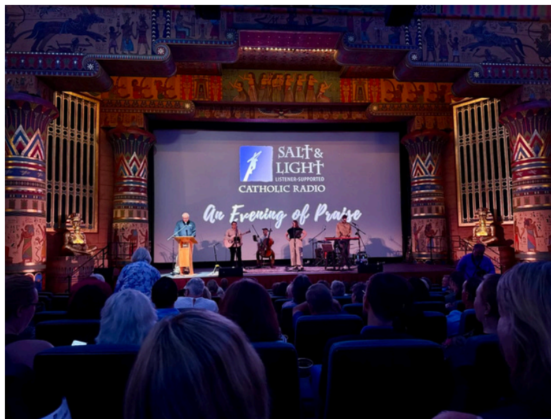
The Vigil Project at the Egyptian Theatre, Boise